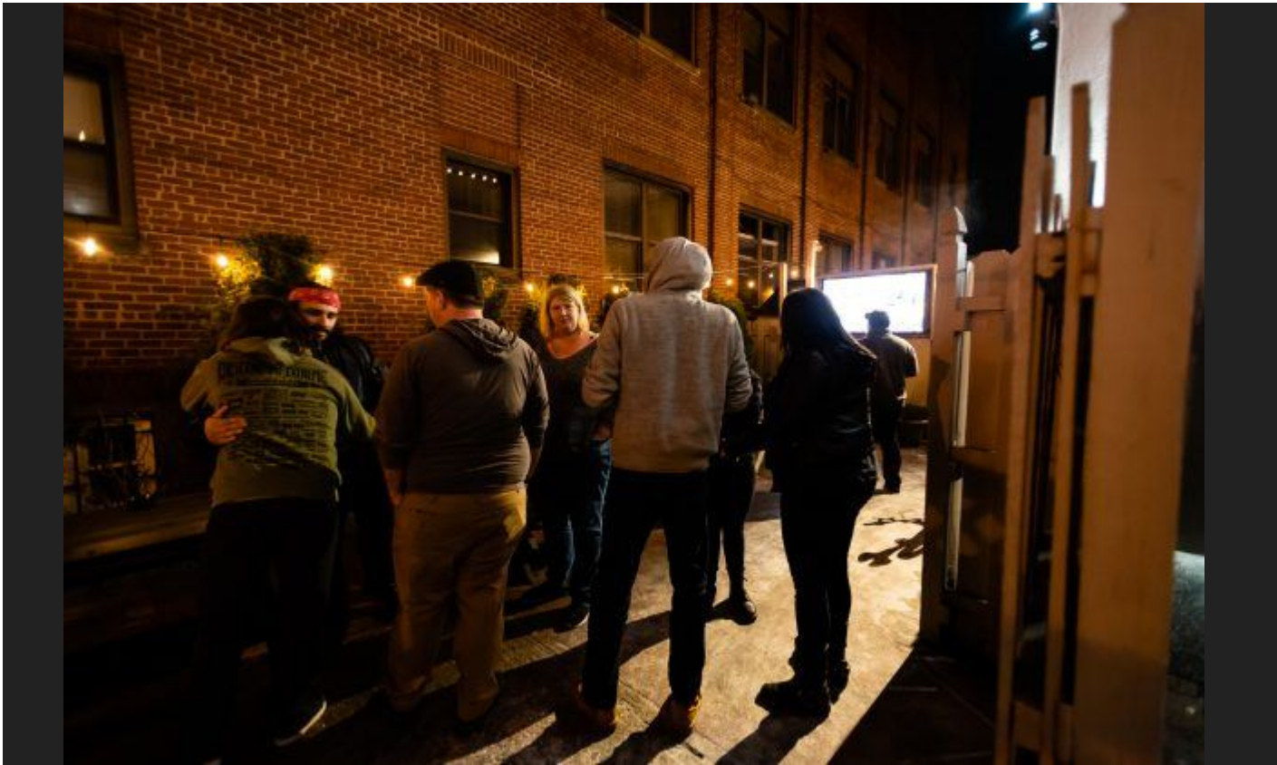
At Just Jake's about 200 found a venue to join other Patriot and Rams fans at watering holes, and private parties, for 2019 Super Bowl Sunday in Montclair, Feb. 3.