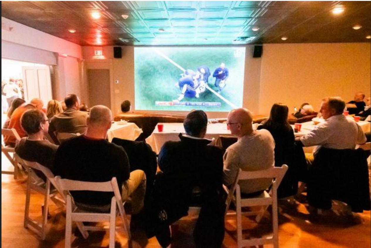
About 150 watch the Super Bowl at the Commonwealth Club. The 2019 Super Bowl Sunday crowd in Montclair found venues to join other Patriot and Rams fans at watering holes, and private parties, Feb. 3.