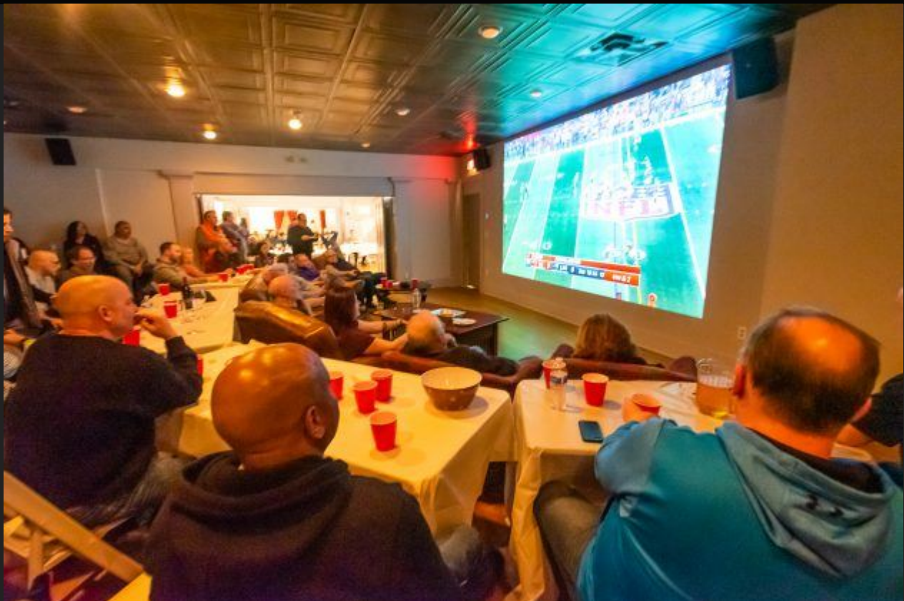
About 150 watch the Super Bowl at the Commonwealth Club. The 2019 Super Bowl Sunday crowd in Montclair found venues to join other Patriot and Rams fans at watering holes, and private parties, Feb. 3.