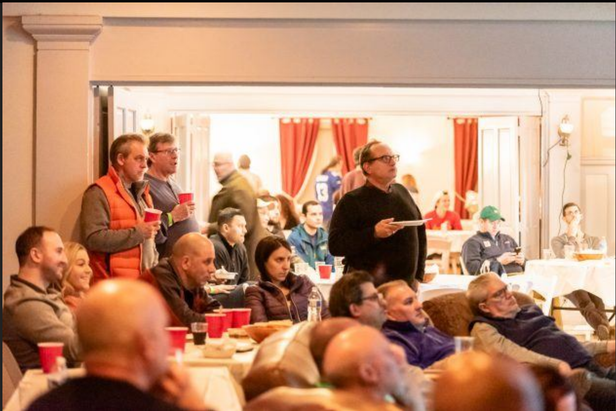
About 150 watch the Super Bowl at the Commonwealth Club. The 2019 Super Bowl Sunday crowd in Montclair found venues to join other Patriot and Rams fans at watering holes, and private parties, Feb. 3.