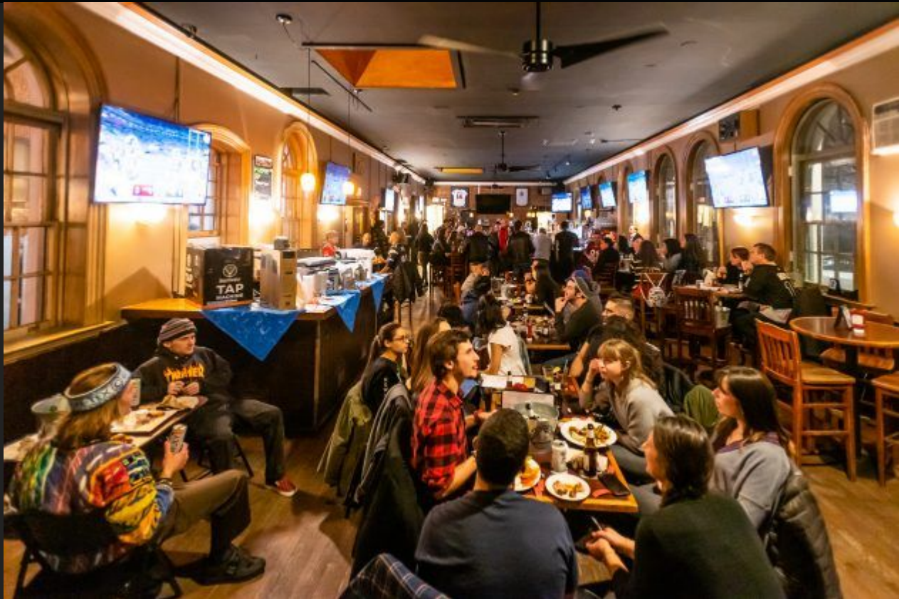
At Just Jake's about 200 found a venue to join other Patriot and Rams fans at watering holes, and private parties, for 2019 Super Bowl Sunday in Montclair, Feb. 3.