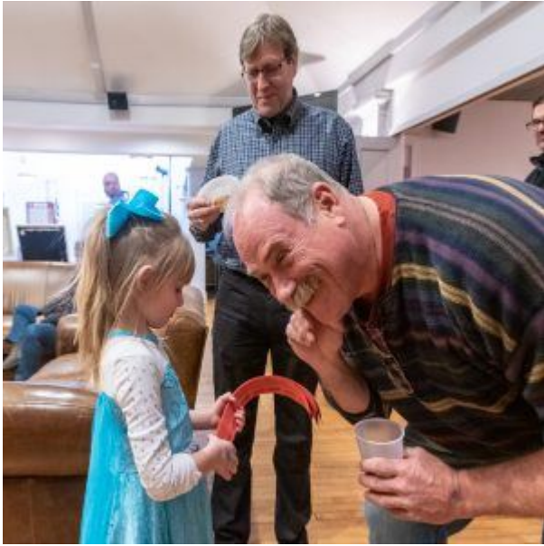
Photos: Montclairites' Fundraiser followup for the Walnut/Valley fire victims