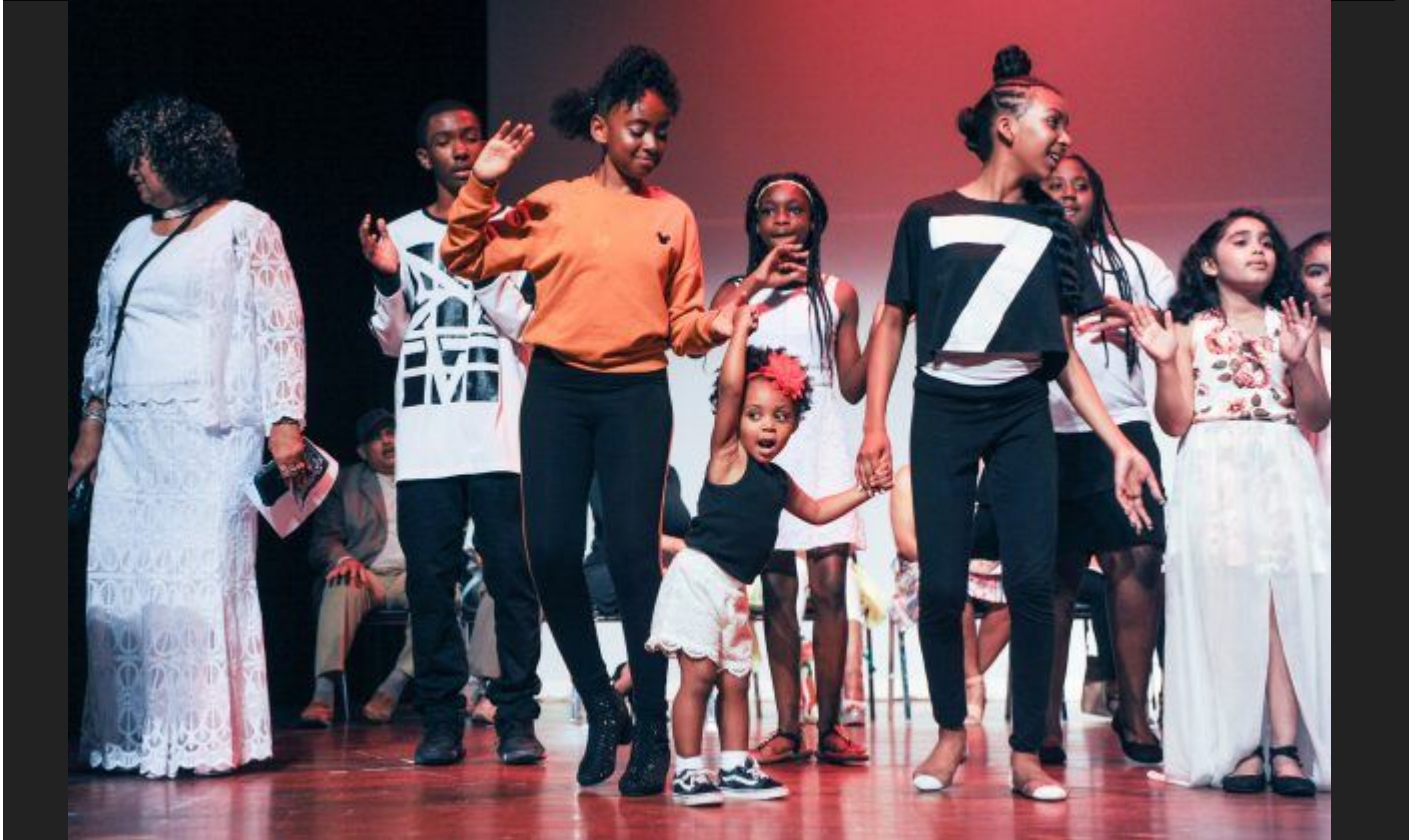
Children and grownups alike sway to music on stage.