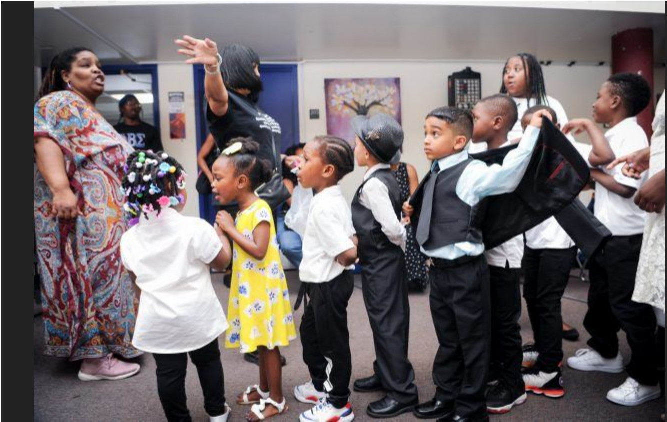
Children wait to go on stage.