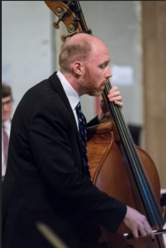
Montclair Orchestra's Tour of Color, Sunday night, May 13, 2018, at St Luke's Episcopal Church, is Montclair Orchestra's season finale, with a nod to the Montclair Film Festival, the film-inspired score Le bœuf sur le toit completes the first season. Ravel: Le tombeau de