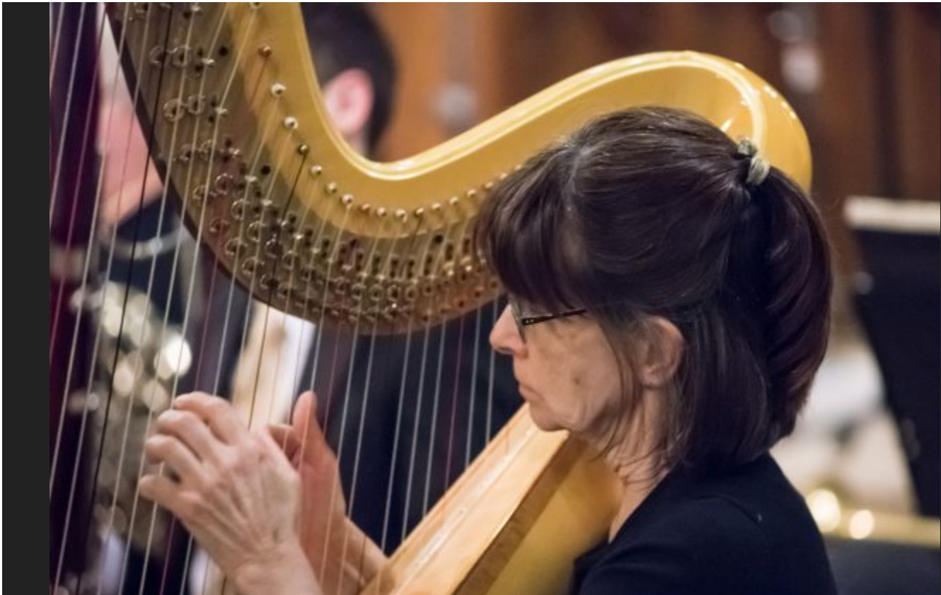
Montclair Orchestra's Tour of Color, Sunday night, May 13, 2018, at St Luke's Episcopal Church, is Montclair Orchestra's season finale, with a nod to the Montclair Film Festival, the film-inspired score Le bœuf sur le toit completes the first season. Ravel: Le tombeau de Couperin Tchaikovsky: "Mozartiana" Suite Mozart: Serenata Notturna Milhaud: Le bœuf sur le toit