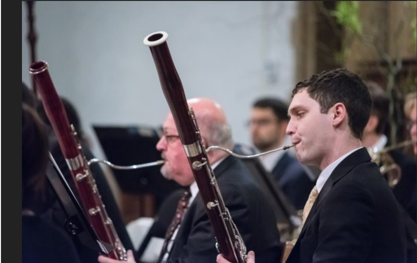
Montclair Orchestra's Tour of Color, Sunday night, May 13, 2018, at St Luke's Episcopal Church, is Montclair Orchestra's season finale, with a nod to the Montclair Film Festival, the film-inspired score Le bœuf sur le toit completes the first season. Ravel: Le tombeau de