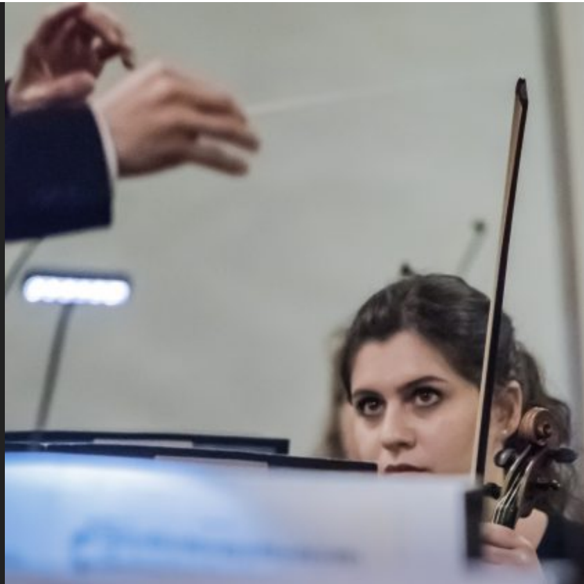
Montclair Orchestra's Tour of Color, Sunday night, May 13, 2018, at St Luke's Episcopal Church, is Montclair Orchestra's season finale, with a nod to the Montclair Film Festival, the film-inspired score Le bœuf sur le toit completes the first season. Ravel: Le tombeau de Couperin Tchaikovsky: "Mozartiana" Suite Mozart: Serenata Notturna Milhaud: Le bœuf sur le toit