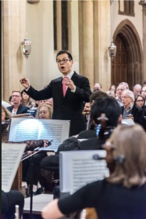
Montclair Orchestra's Tour of Color, Sunday night, May 13, 2018, at St Luke's Episcopal Church, is Montclair Orchestra's season finale, with a nod to the Montclair Film Festival, the film-inspired score Le bœuf sur le toit completes the first season. Ravel: Le tombeau de Couperin Tchaikovsky: "Mozartiana" Suite Mozart: Serenata Notturna Milhaud: Le bœuf sur le toit