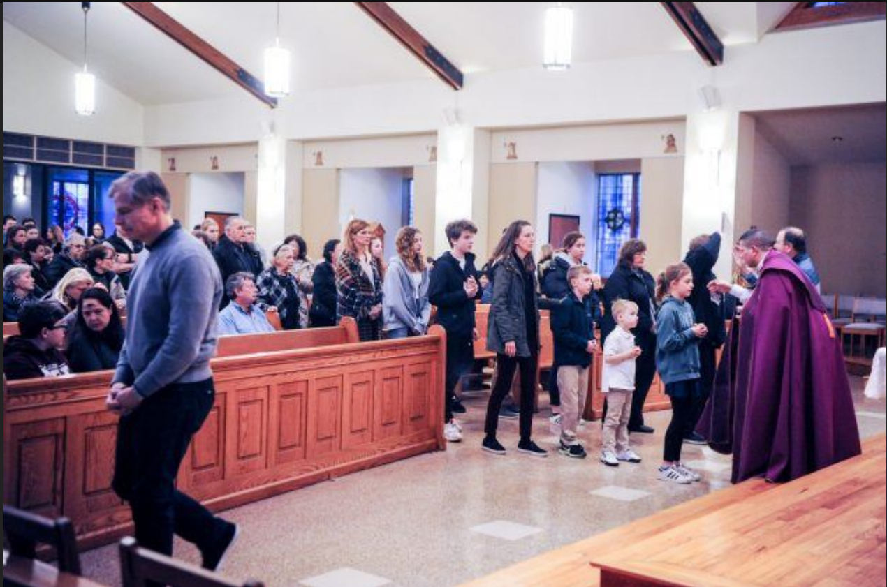
St. Cassian Parishioners form a procession to receive ashes.