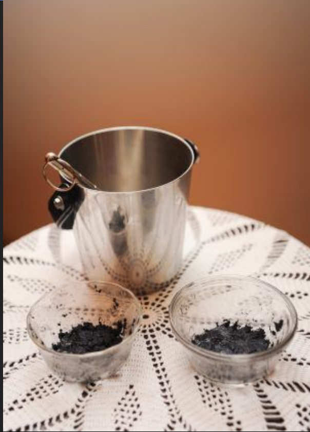
The ashes rest in glass bowls.