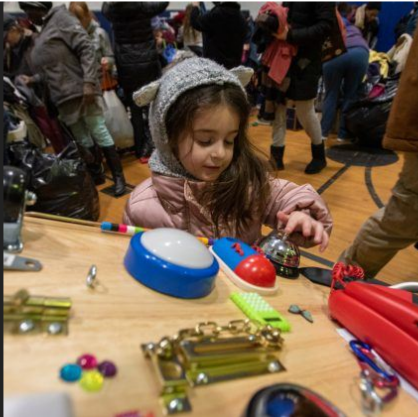
Violet tries out the "bells and whistles" on the new-to-her activity board.