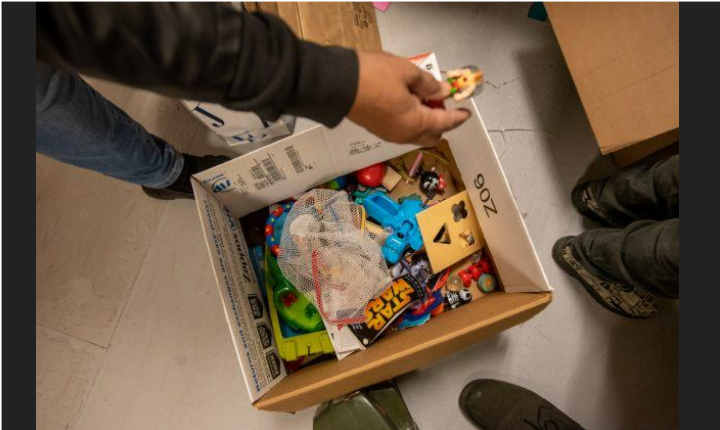
Boxes of toys lining the walls under the tables in the hallway get pawed through for special finds.