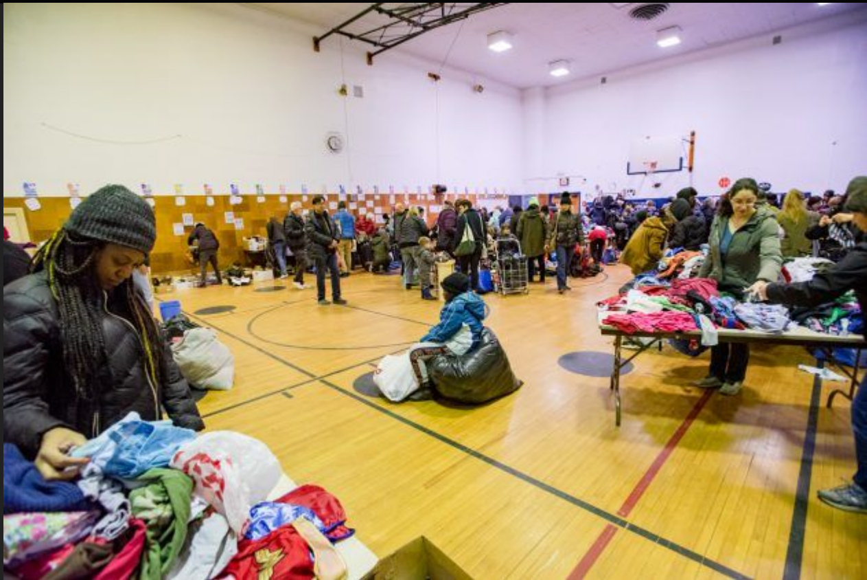
One of the children supervises a pile of finds as the crowd swarms through the tables laden with goods.