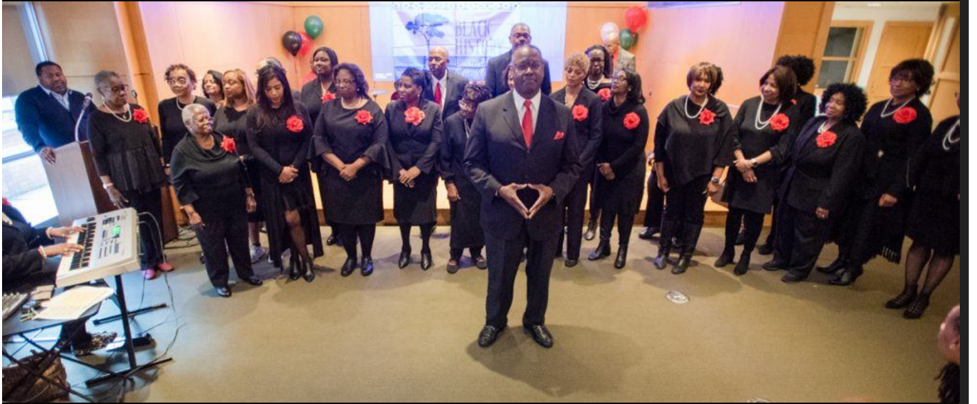
The Mass Choir assembles for their performance.