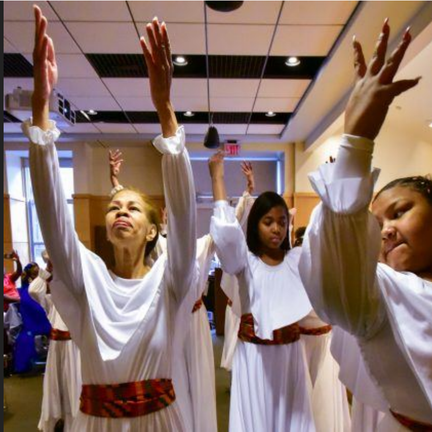
The Liturgical Dance Ministry: "Jesus Walks with Me."