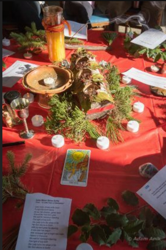
The table is set for the Winter Solstice celebration in the Rotunda