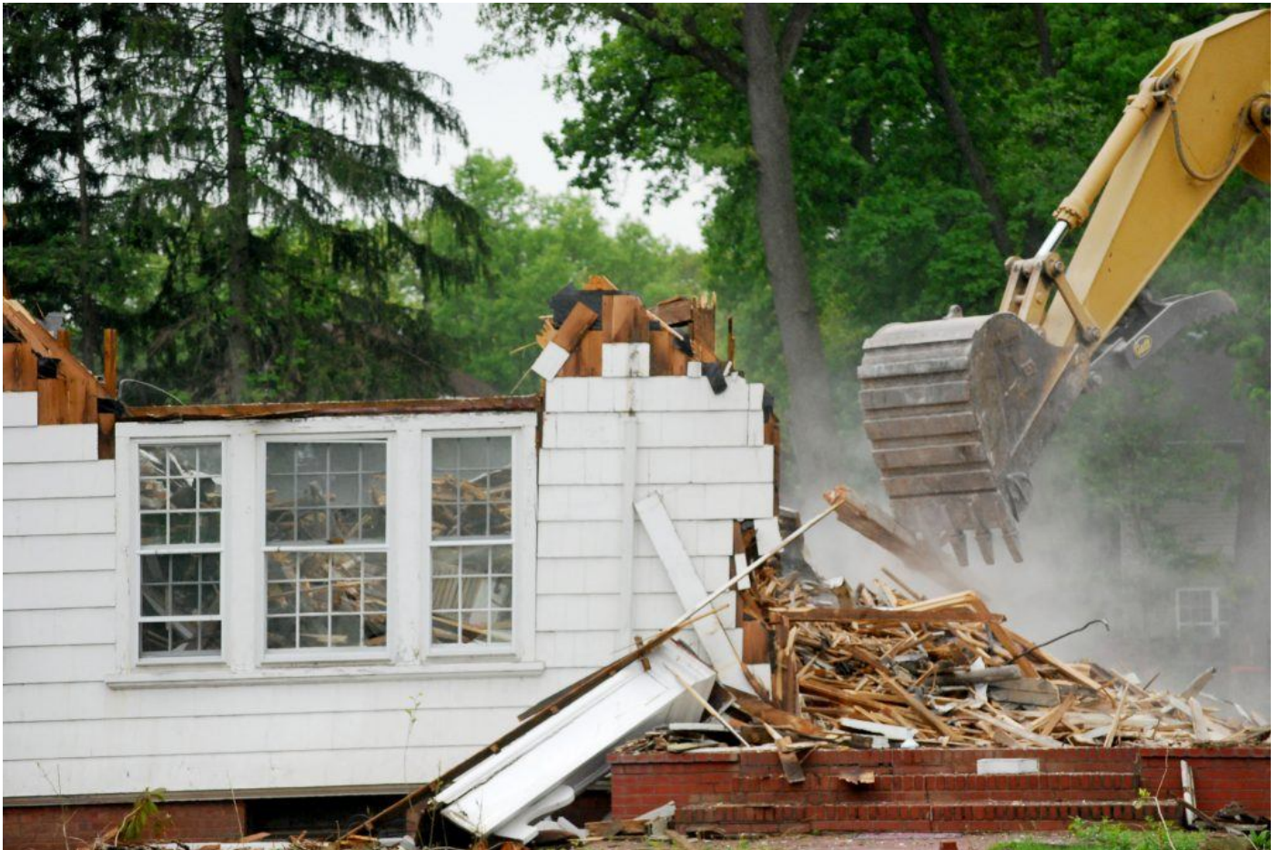
The demolition of the Aubrey Lewis Estate in Montclair's South End in 2018.

Earlier this week, we reported on the Montclair Township Council expressing its wishes for a stronger no-knockdown law to prevent the razing of older homes in town, in the wake of the demolition of century-old