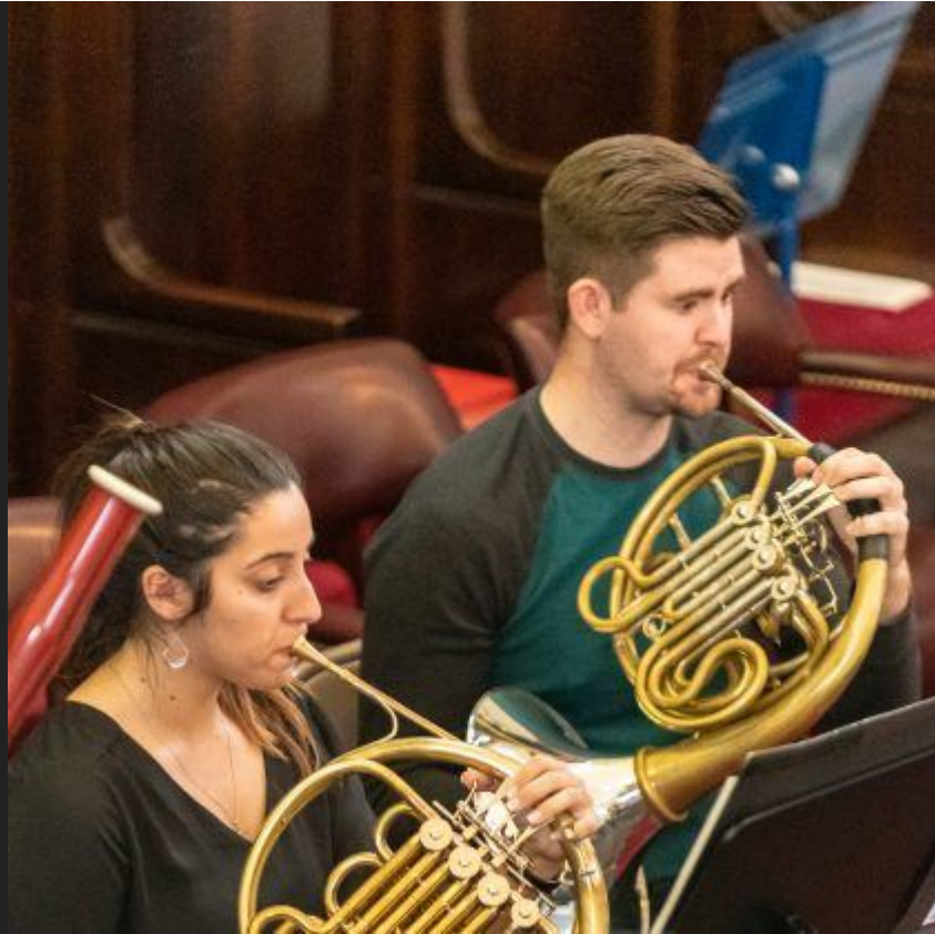
The Montclair Orchestra rehearses the last movement of Mozart's Symphony No. 40 in g minor, K. 550 W.A. in preparation of the their March 10th concert, Lyric, in Central Presbyterian Church, Sunday, March 3.