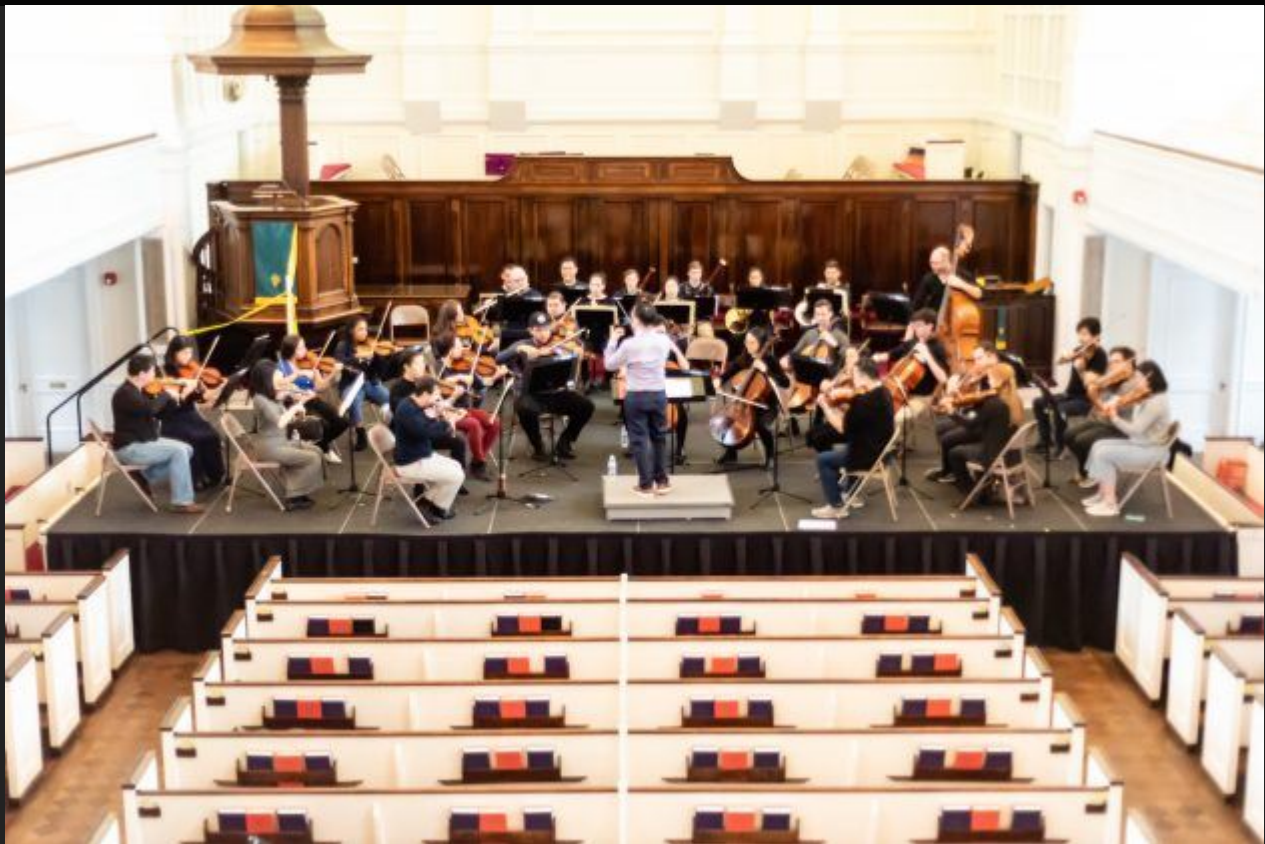
The Montclair Orchestra rehearses the last movement of Mozart's Symphony No. 40 in g minor, K. 550 W.A. in preparation of the their March 10th concert, Lyric, in Central Presbyterian Church, Sunday, March 3.