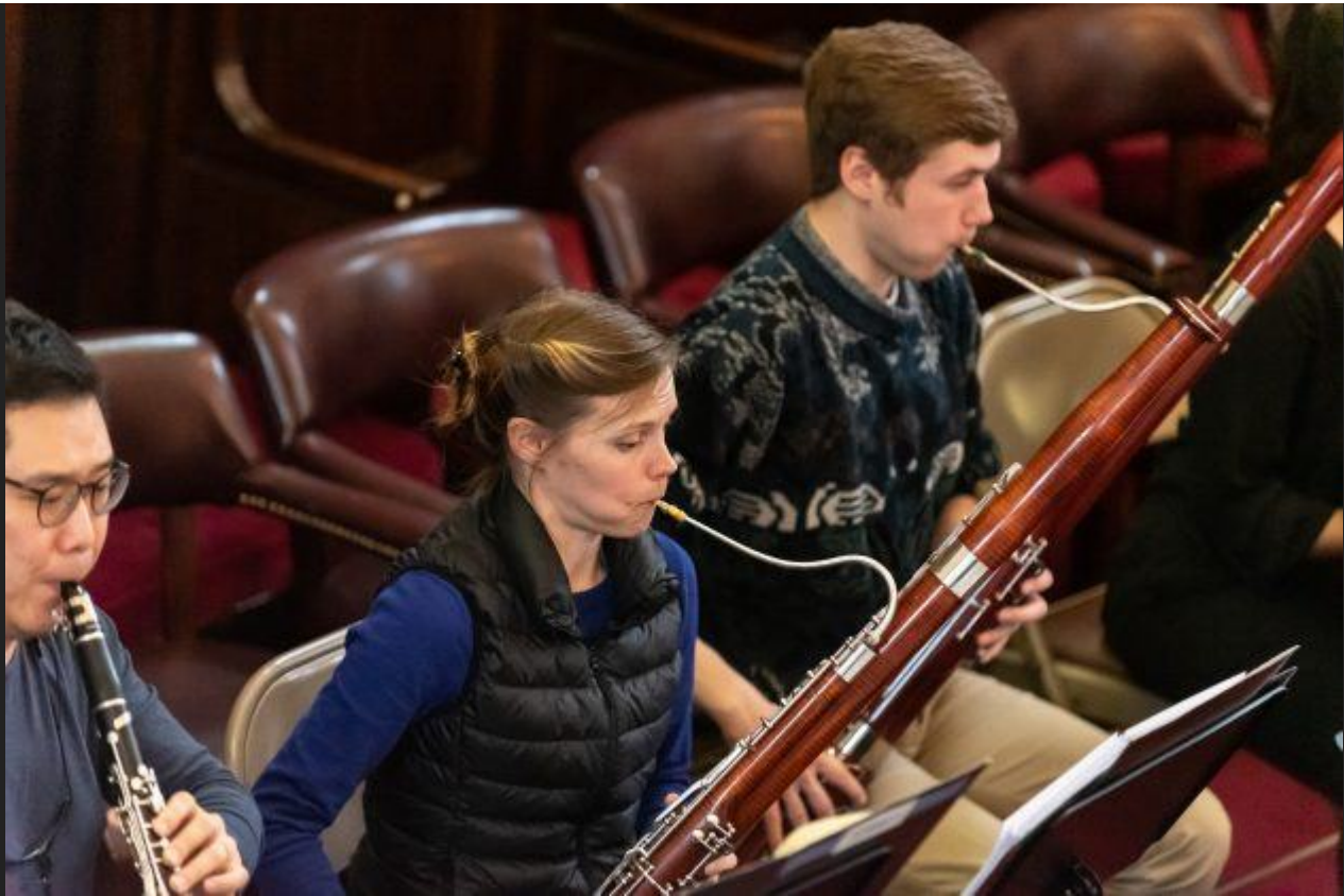
The Montclair Orchestra rehearses the last movement of Mozart's Symphony No. 40 in g minor, K. 550 W.A. in preparation of the their March 10th concert, Lyric, in Central Presbyterian Church, Sunday, March 3.