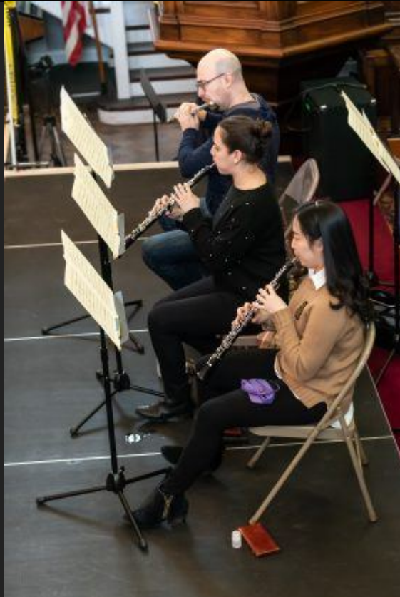
The Montclair Orchestra rehearses the last movement of Mozart's Symphony No. 40 in g minor, K. 550 W.A. in preparation of the their March 10th concert, Lyric, in Central Presbyterian Church, Sunday, March 3.