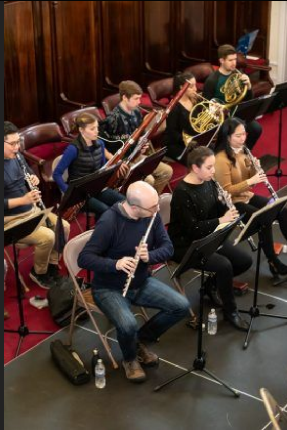
The Montclair Orchestra rehearses the last movement of Mozart's Symphony No. 40 in g minor, K. 550 W.A. in preparation of the their March 10th concert, Lyric, in Central Presbyterian Church, Sunday, March 3.